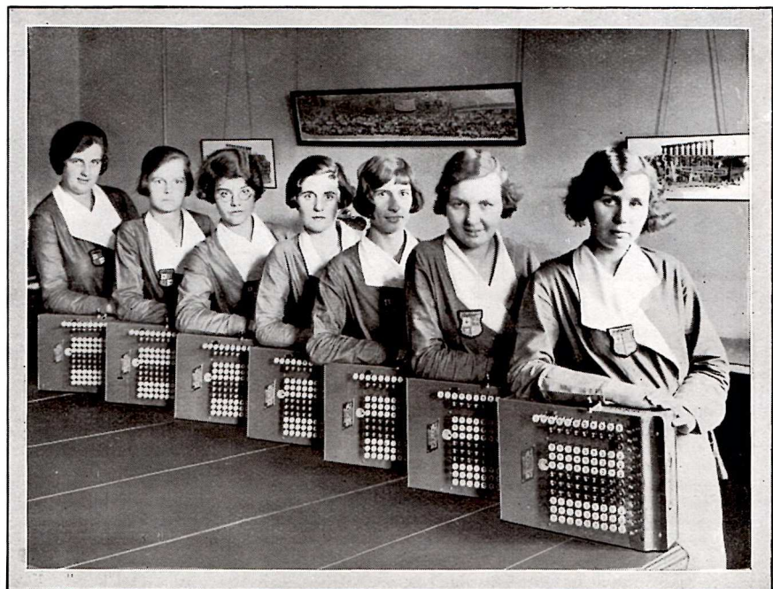
The Birmingham Branch Calculating Dept. Staff.—"AT YOUR SERVICE,"