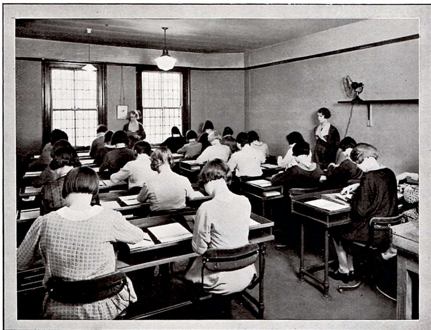
Birmingham Speed School,