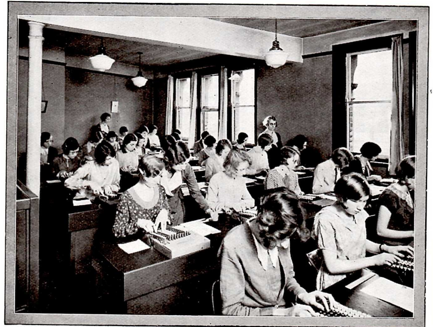
Part of the Birmingham Elementary School.