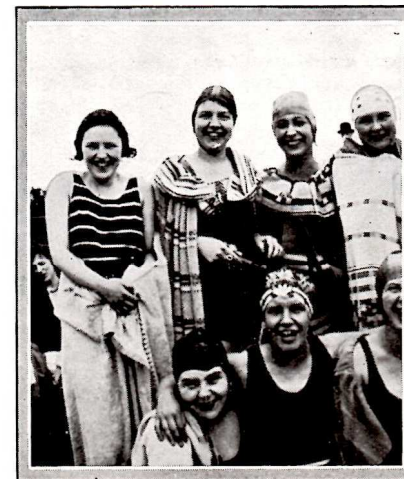
A Happy Group of Operators at Southport,