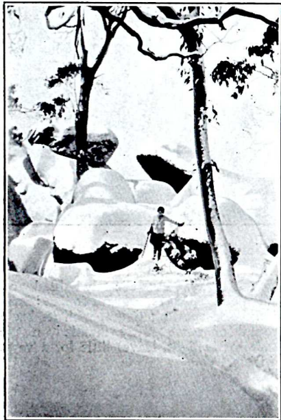
Class I. —"Snow at Mount Buffalo." A difficult subject which received honourable mention, with particular regard to composition and light values.