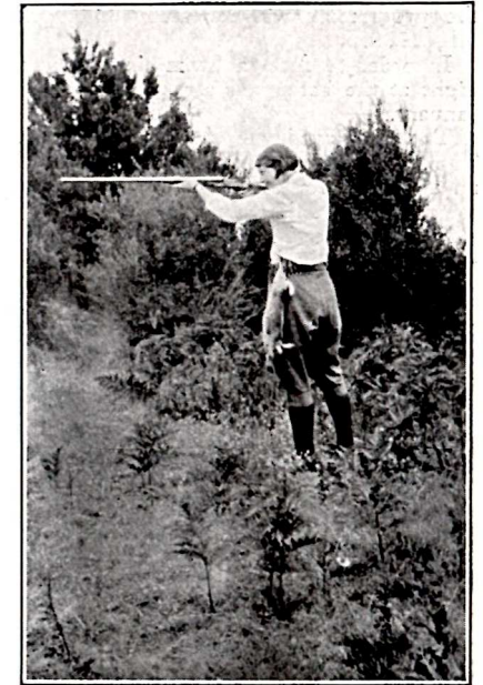
Class 2.—Figure Subject.

This subject appears to have been carefully selected in order to produce a well-balanced and artistic picture, with fine appreciation of subtle light and shade.